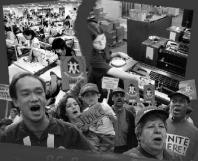
Organizing for Economic Justice