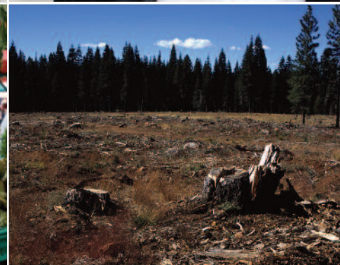
Photos: (Left) Causa Justa/Just Cause rally, Oakland, CA. (Upper center) Hands of a farmworker. (Lower center) Porto Palazzo, Torino, Italy. (Upper right) Causa Justa Valentines Day Action. (Lower right) Sierra clearcut. (Front cover, upper) Mural in Oakland.